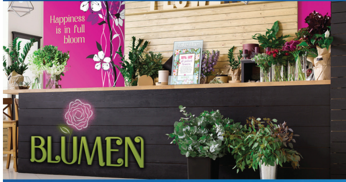
Elevate Your Visibility with Signs.

Nearly every type of sign you need we do to get the exposure your business deserves.